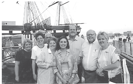
TSPRAs and NSPRAs seeing the sites in Baltimore.