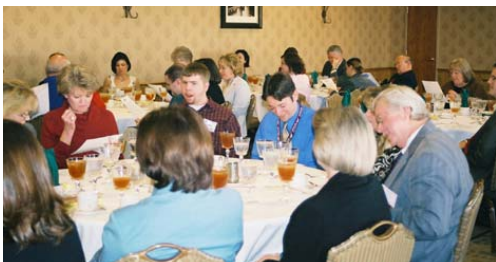
Over 80 new members and TSPRA leaders attended this year's New Member Luncheon.