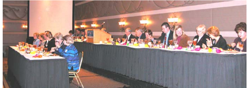
New 2004-2005 officers, seated in front, were installed at the Installation Luncheon held at the Hyatt Regency Austin, Feb. 19.