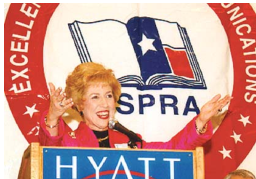
TSPRAnS from Region 4 greeted Commissioner of Education Shirley Neeley with cheers and pompoms. Neeley addressed TSPRAnS at the Third General Session.