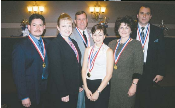
Pictured above and right are some of the 2003 Star Awards Best of Category winners in the print, electronic and video categories.