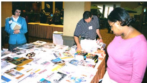
TSPRAnS pick up great ideas at the conference Publications Exchange.